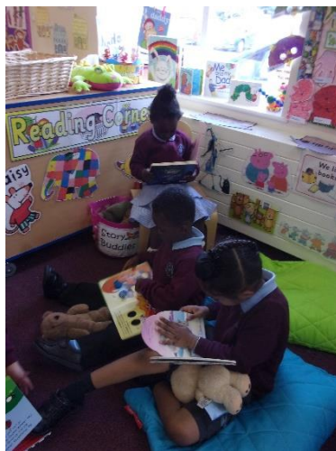
Reading in the book corner

When you read the book help your child to hold the book the right way up and turn the pages carefully. Talk about the pictures and point to the words as you say them.