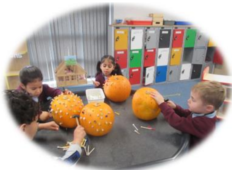
Working co-operatively with each other

There will be a balance between adult directed activities and activities that your child can choose to do for themselves. Adults will support their play and investigation while encouraging your child's independence. All the activities are structured to ensure that all children are able to access them and progress at their own rate.